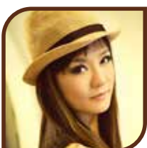
Zheng Yu Lan • National level actor