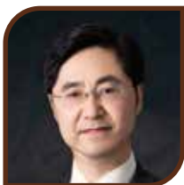
Yang Yan di