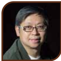
Eddie Chiu • Hong Kong's famous pop music creation and Production talent, record producer