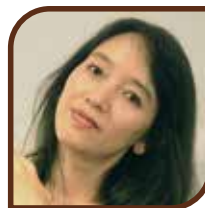
Tang Pin Fei