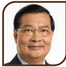
Honorary President Tam Yiu Chung

GBM, GBS, JP Member of the 13rd Standing Committee of the National People's Congress